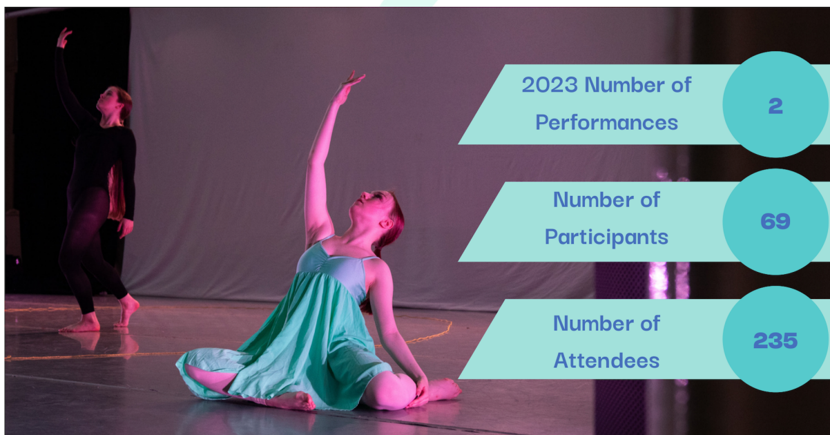
Performance at Spring showcase.

Citymoves' Spring Show is a brilliant variety of dance at its best. Our Spring Showcase is run annually and features our performance groups and invites other dance groups and schools from across the North East. The Spring Show develops performer skills and the sense of dance community, which provides a platform for the dancers to express themselves physically, emotionally and creatively in a safe space surrounded by others who share the same passion.